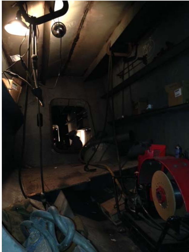
Arch Segment WA5-N