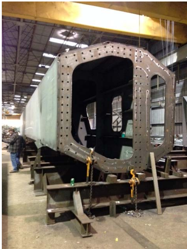
Arch Segment WA4-N