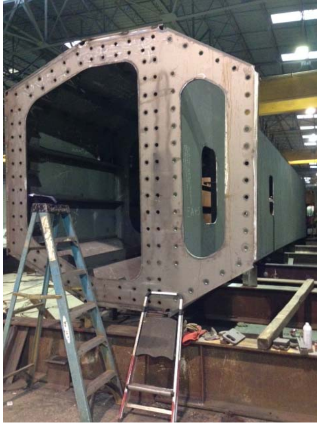
Arch Segment EA4-S