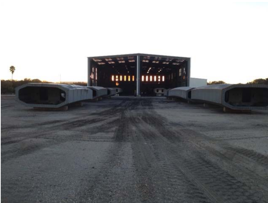
Arch Segments waiting to be painted