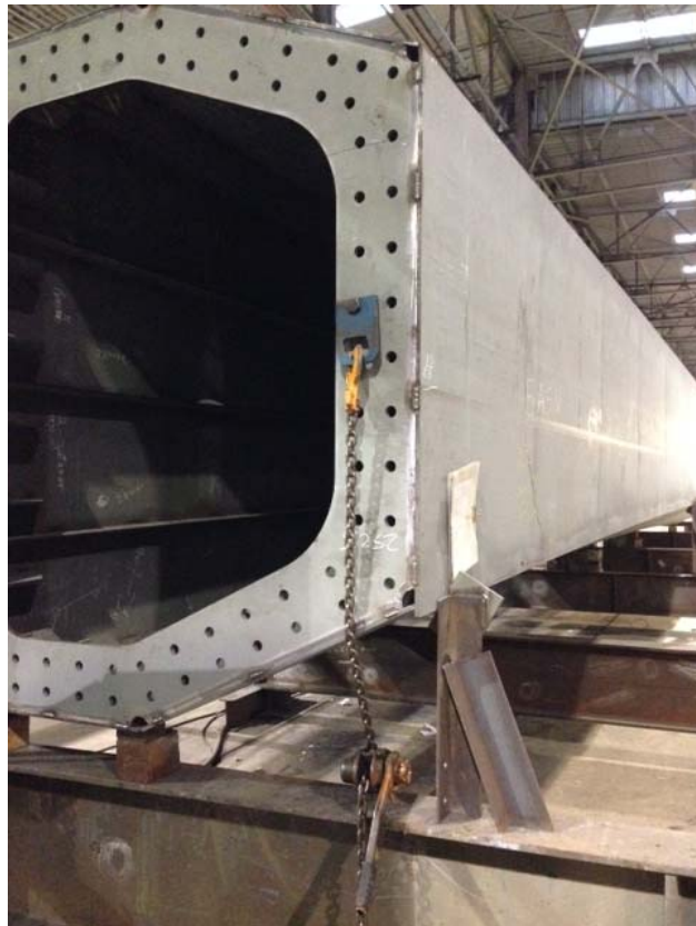
Arch Segment EA5-N