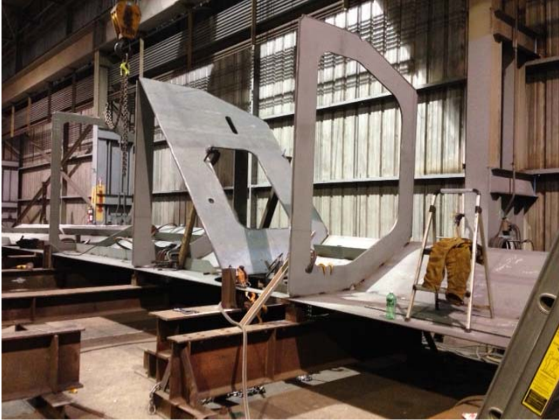
Arch Segment WA4-S Fit-Up