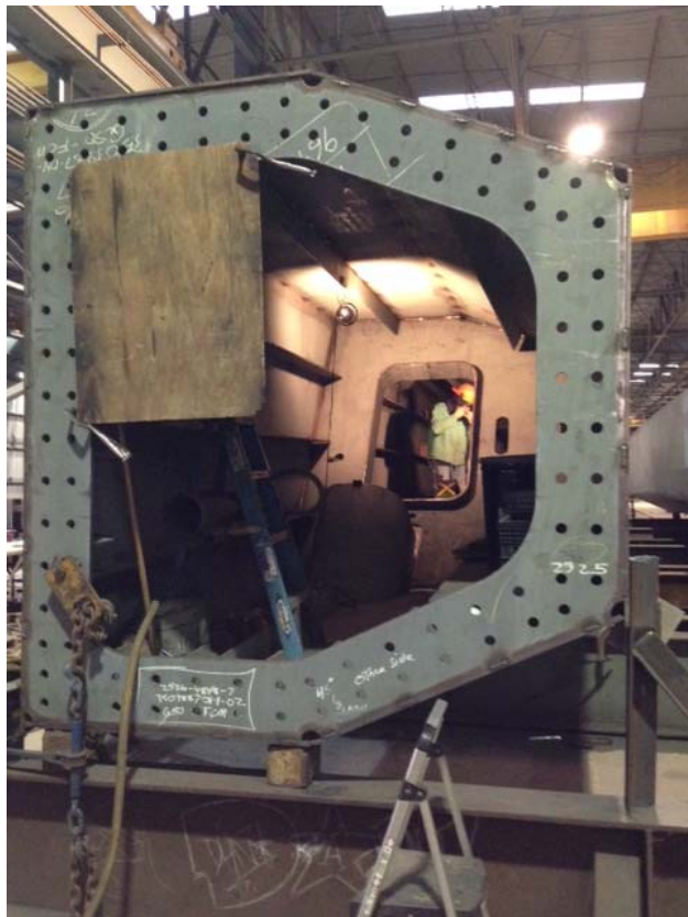
Arch Segment EA6-N