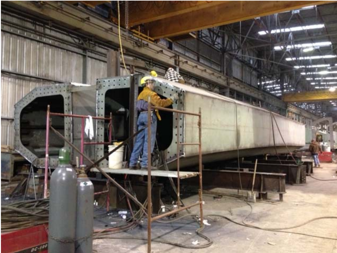
Arch Segment EA7