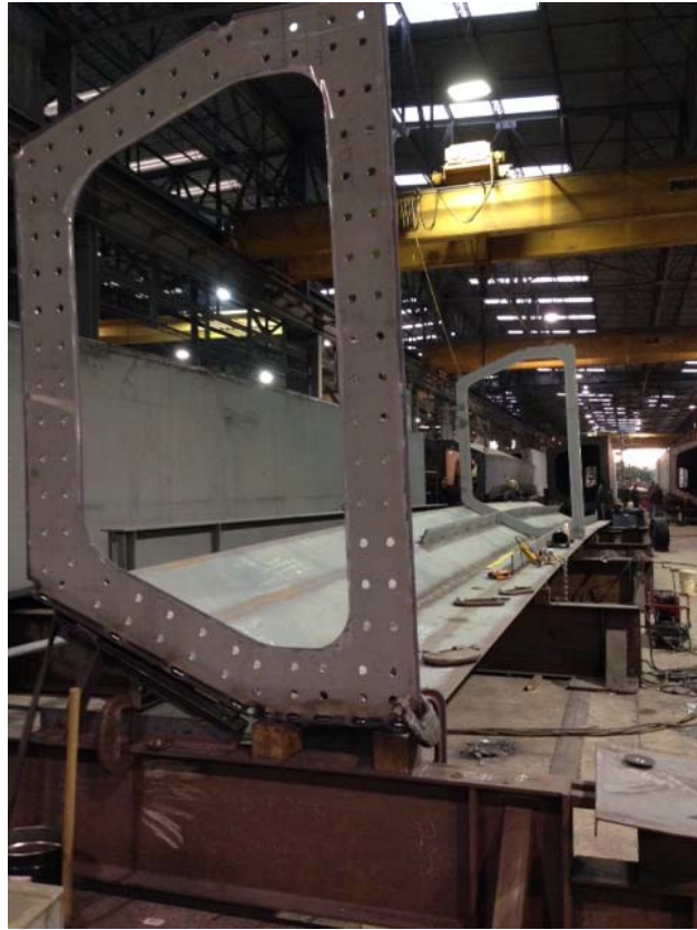
Arch Segment EA2-S Fit-Up