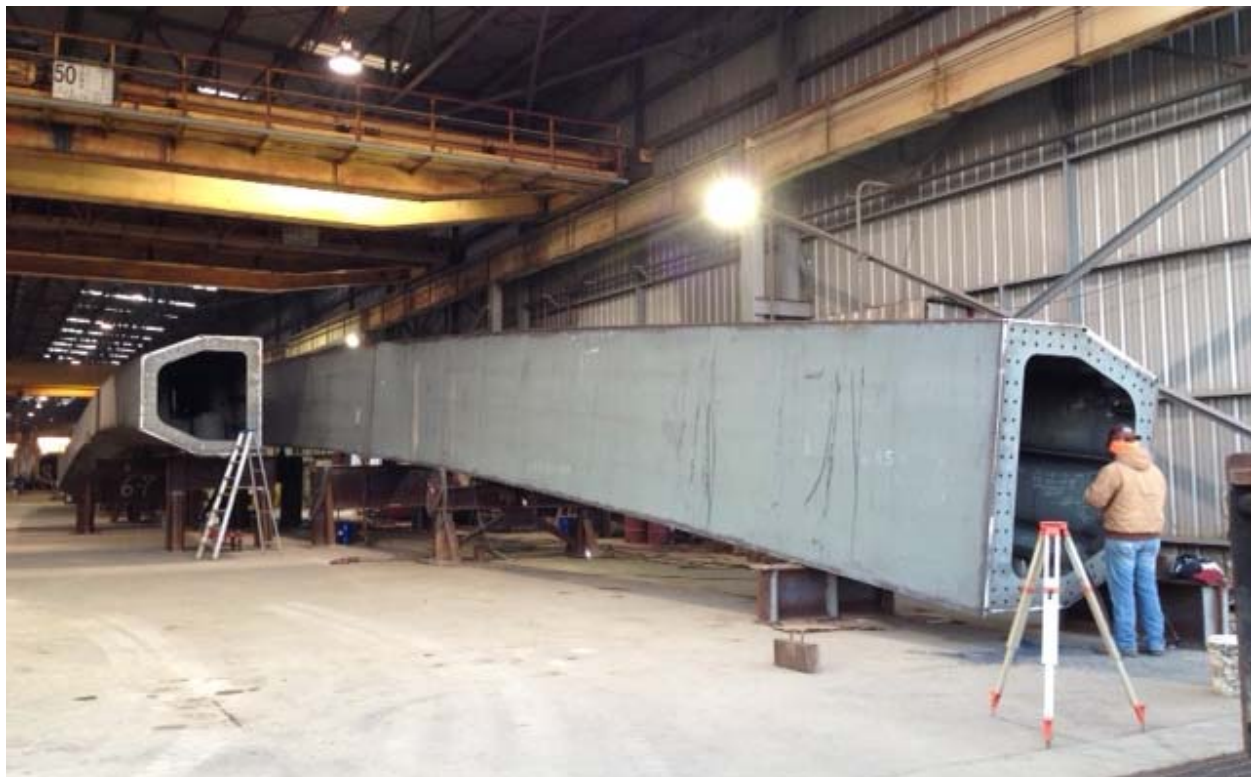
Arch Segments WA8, WA7, WA6, and WA5-S in Laydown Assembly