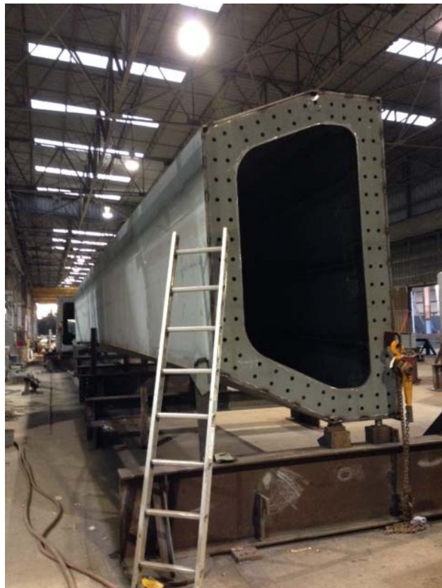
Arch Segment WA2-N